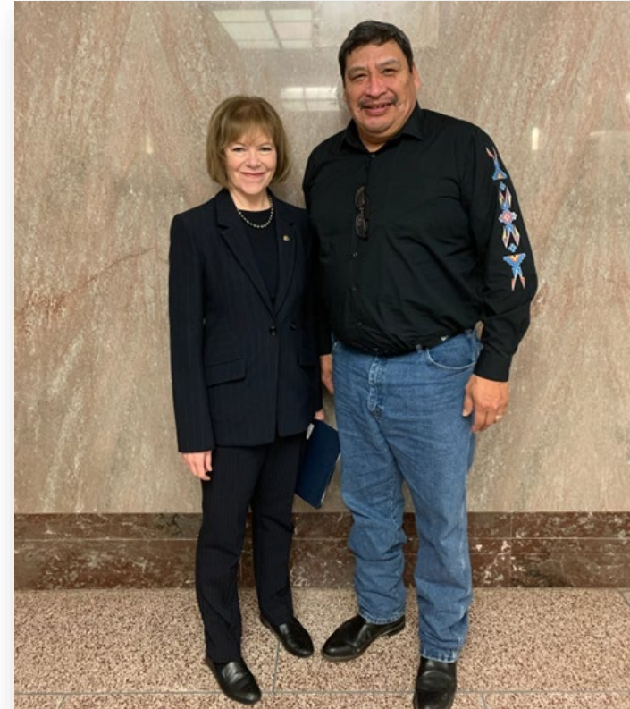
Senator Tina Smith (D-MN)