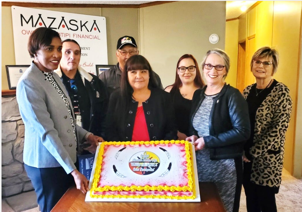
First 502 relending loan closings with USDA Washington and SD staff