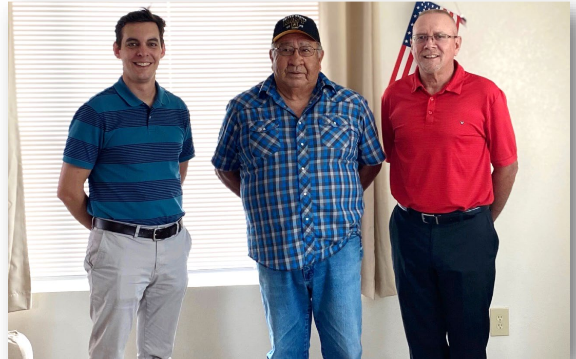
VA site visit with Senator Rounds staff