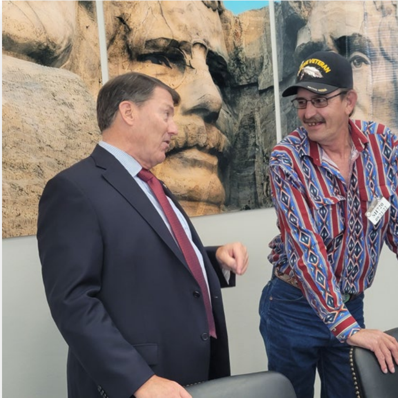
Senator Mike Rounds (R-SD)